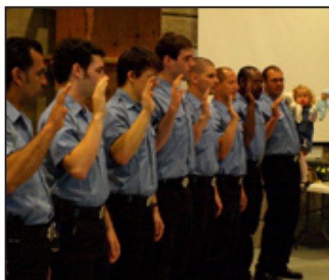
May 15 Recruit Graduation Class