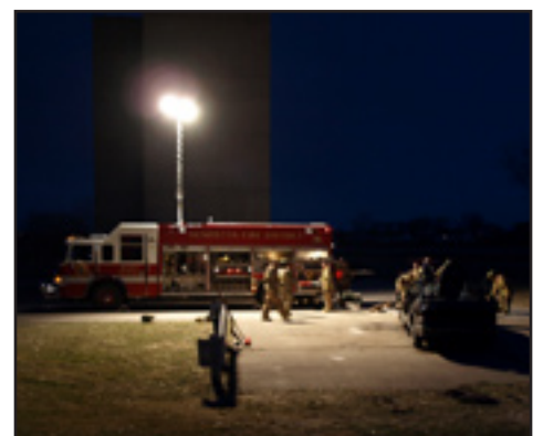
Night extrication training